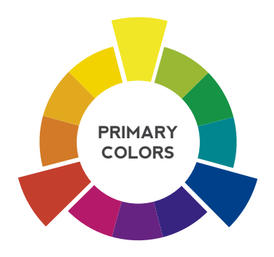
Red, yellow and blue