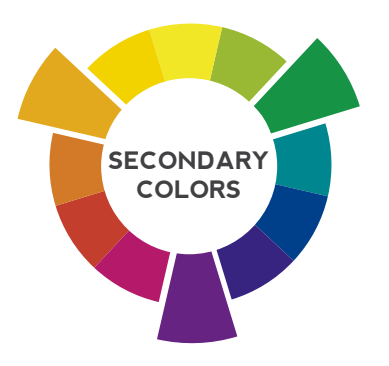
Green, orange and purple