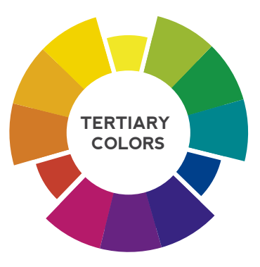
Yellow-orange, red-orange, red-purple, blue-purple, blue-green & yellow-green